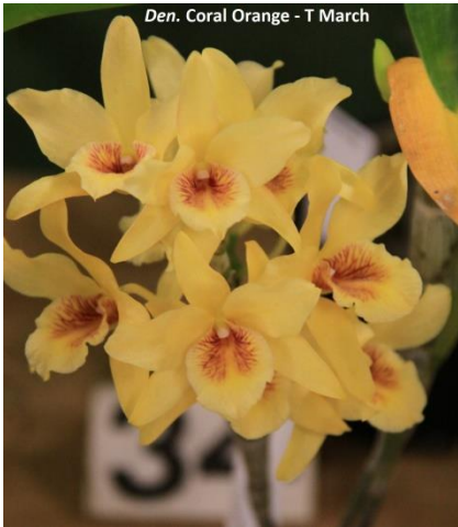
Den. Coral Orange - T March