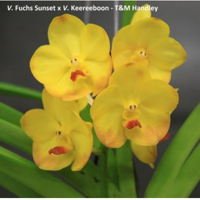
V. Fuchs Sunset x V. Keereeboon - T&M Handley