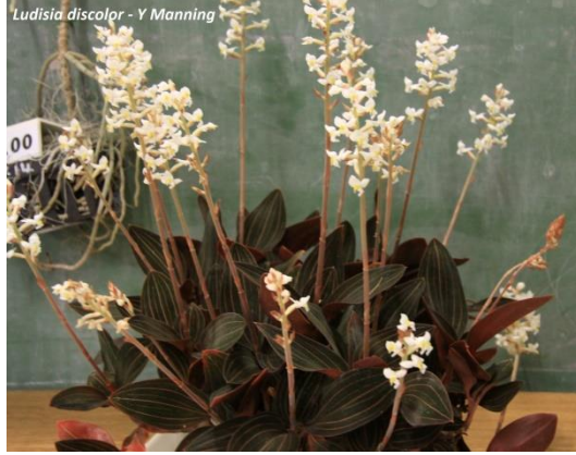
Ludisia discolor