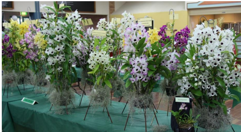
Table of Softcane Dendrobiums 2014 Spring Show >

Notice to Members - please assist with cleaning the hall after the meeting The closing date for articles to be included in the next newsletter are to be received by the 6 th October 2017; articles received after that date will be included in the following month. Ed.