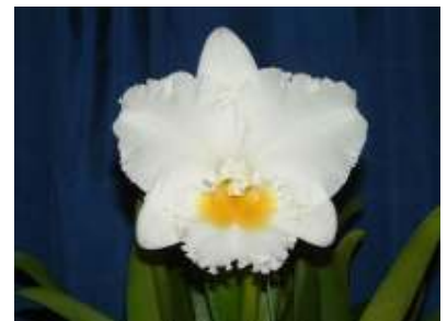
Blc. Burdekin Dream