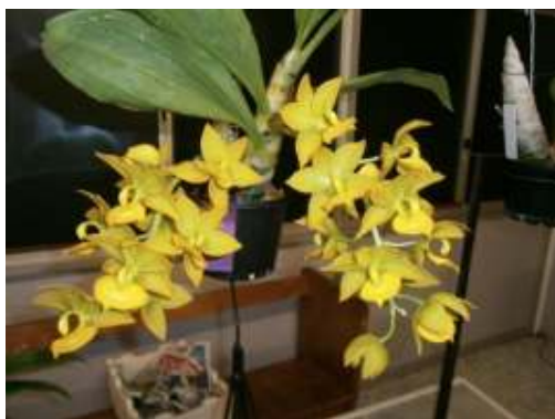
Cycd. Jumbo Puff