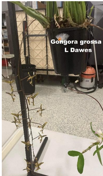
Gongora grossa L Dawes