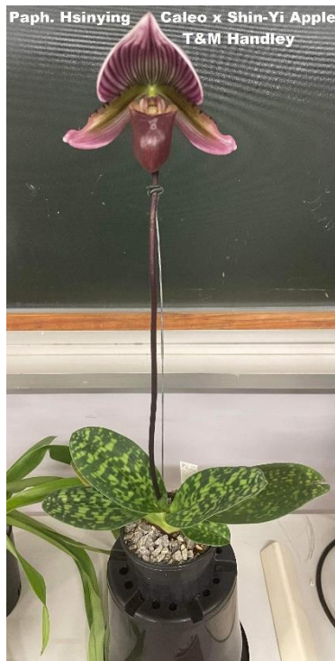
Paph. Hsinying Caleo x Shin-Yi Apple T&M Handley