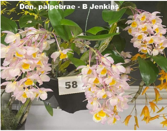
Den. palpebrae - B Jenkins