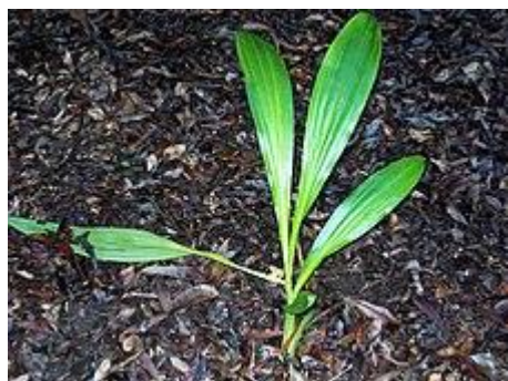
Leaves on a plant in Coffs Harbour

Phaius tankervilleae var. australis , also known as the common swamp orchid , southern swamp-orchid , swamp lily or island swamp-orchid , is a species of orchid endemic to eastern Australia. It is an evergreen, terrestrial herb with large, crowded pseudobulbs, large pleated leaves and flowers that are reddish brown on the inside and white outside.