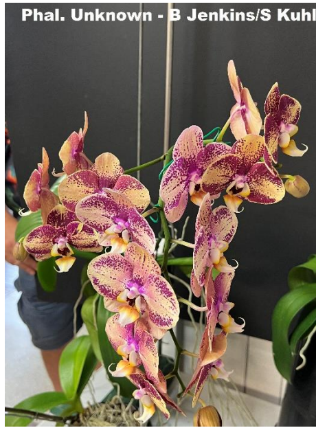
Phal. Unknown - B Jenkins/S Kuhl