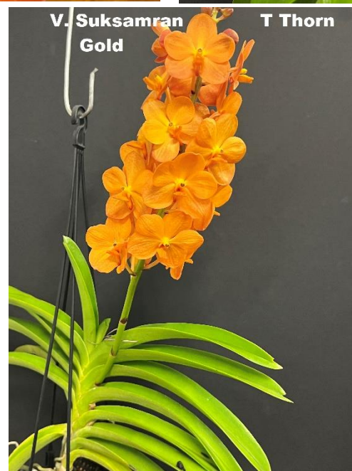
V. Suksamran Gold T Thorn