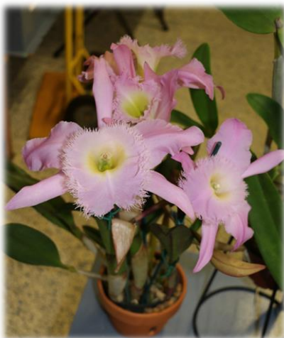
Rlc. Duh's White 'Pink Pig'