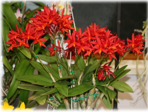
Lc. Rojo 'Redhead'