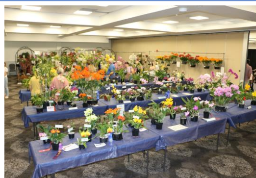
Benched Plants Display