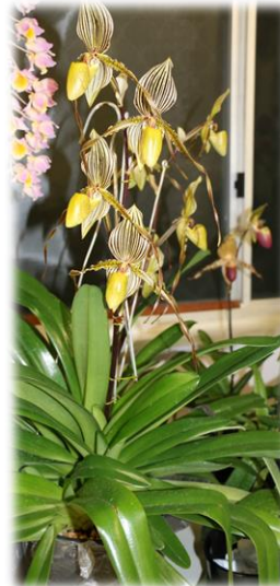
Paph. Saint. Swithin