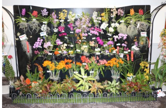
Combined Club Display