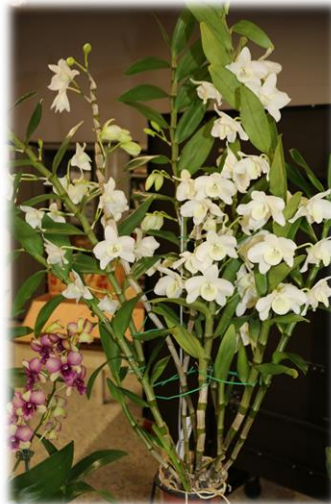
Den. White Pearl