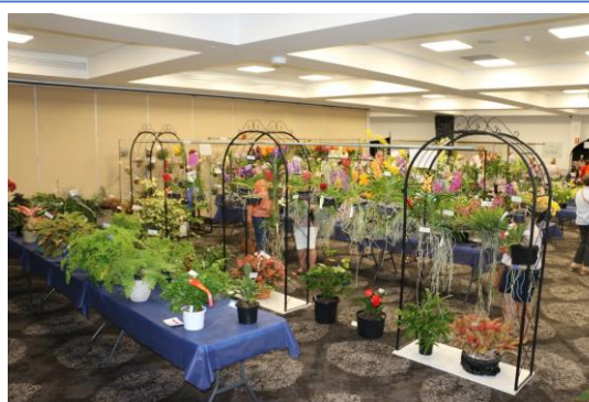
Benched Plants Display