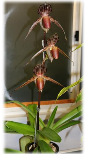
Paph. rothschildianaum 'Ellie'