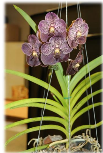
V. Gordon Dillon 'Black Panther'