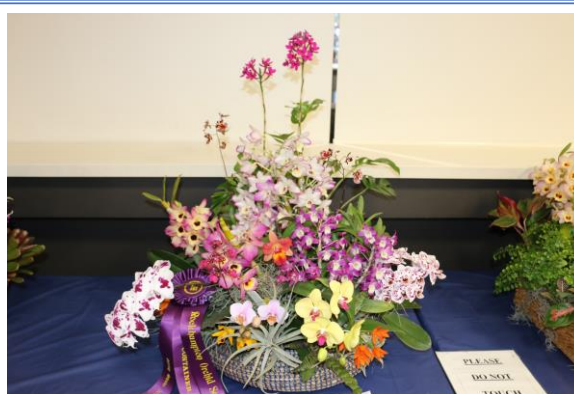
Container Display - 1 st Place.