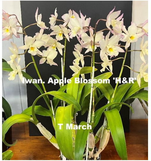
Iwan. Apple Blossom 'H&R'