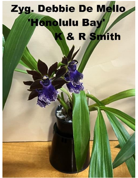
Zyg. Debbie De Mello 'Honolulu Bay'