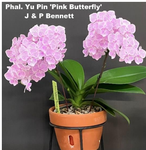
Phal. Yu Pin 'Pink Butterfly'