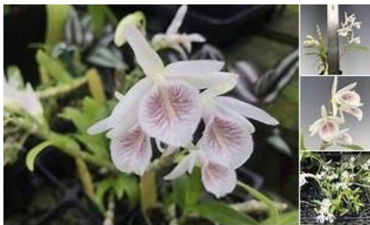
Dendrobium cretaceum (Syn. polyanthum ) - OrchidWeb

(as you will see from the below photo, the lip of the Den. cretaceum is more pointed whereas the Den. polyanthum is more rounded.)