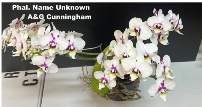
Phal. Name Unknown