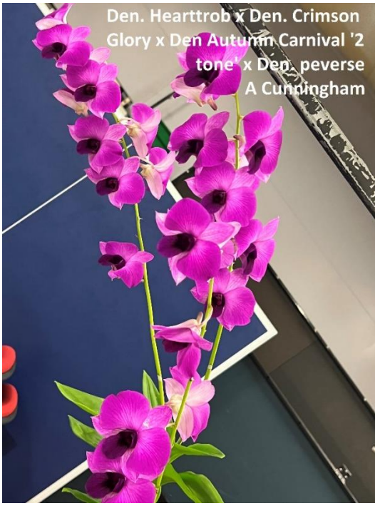
Den. Heartrob x Den. Crimson Glory x Den Autumn Carnival '2 tone' x Den. peverse A Cunningham