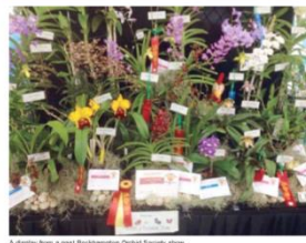
A display from a past Rockhampton Orchid Society show.