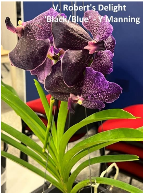
V. Robert's Delight 'Black/Blue' - Y Manning