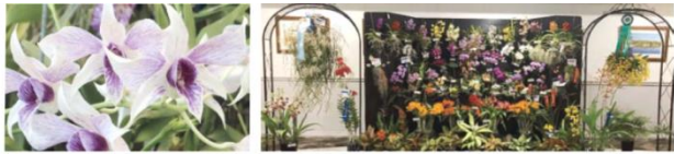
The Rockhampton Orchid Society will present its annual Autumn Show this weekend for the first time since Covid.