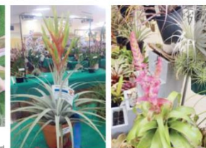
Tillandsia Silver Queen.