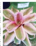
Orchid on show.

I can see that many people who read this column are probably never visited here a show or show. It can be a very rewarding experience, with a wide variety of beautiful orchids, plants, ferns, trees, flowering general plants, Cut Flowers and floral arrangements many of which you will never see in local nurseries. Visitors will see the start of the Rockhampton Orchid Society Autumn Show and if you ever admire the beauty of plants the display by the club members will take some beating.