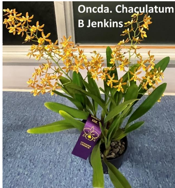
Oncda. Chaculatum B Jenkins