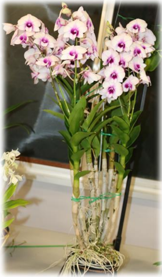
Den. Her Majesty