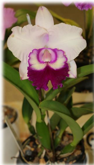
Rlc. Chief Journey 'First Choice'