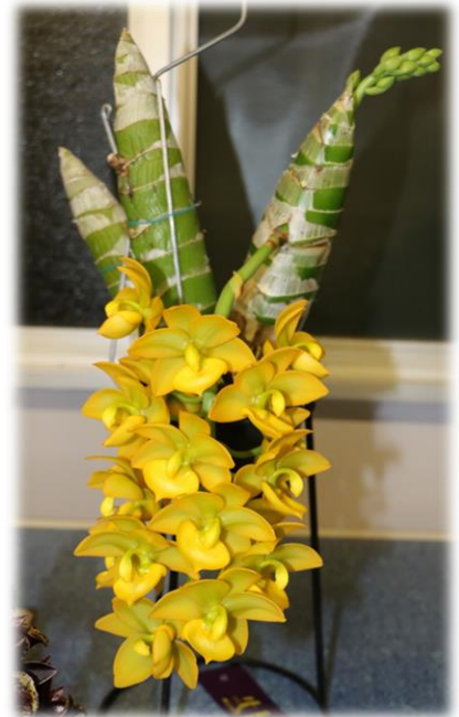
Cygd. Jumbo Puff 'Jumbo Canary'

If staying overnight our preferred accommodation is the Banjo Paterson Motel. Ph: 07 47 252 333.