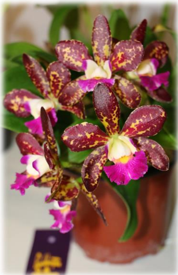
Rlc. Naomi's Delight