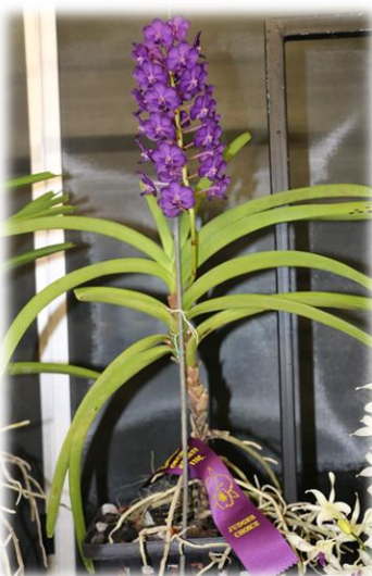
Van. Pine Rivers 'Wasana'