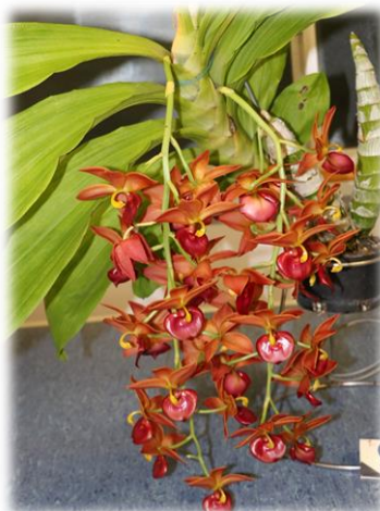
Cycd. Taiwan Gold