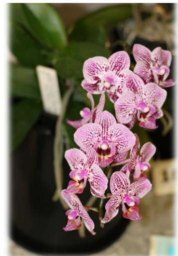
Phal. Lianher Cranberry