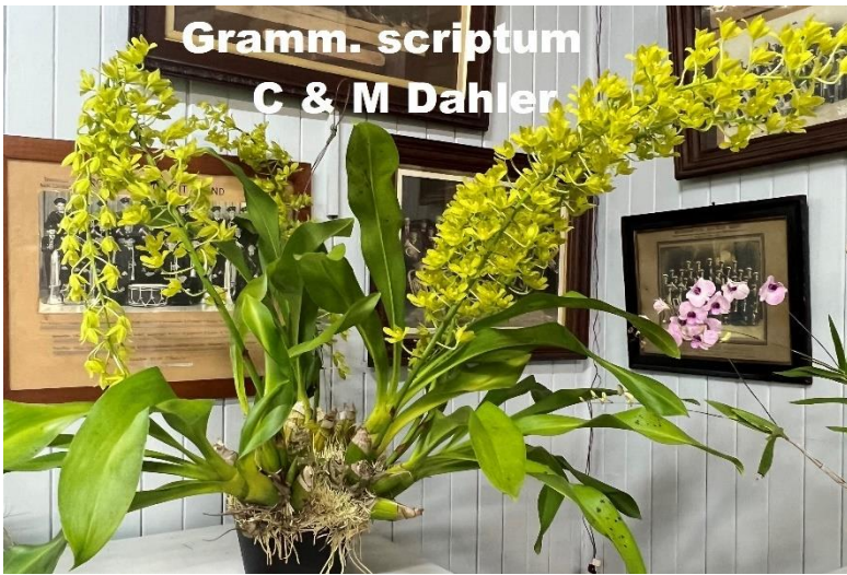
Gramm. scriptum C & M Dahler