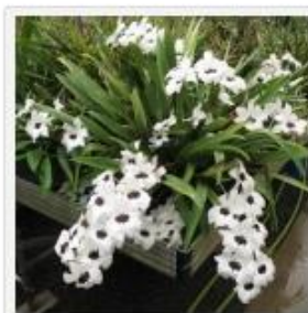
Milioniopsis Lillian Nakamoto 'Tanto'