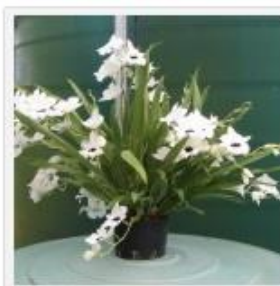
Milioniopsis Lillian Nakamoto 'Tanto'