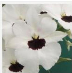
Milioniopsis Lillian Nakamoto 'Tanto'