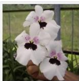
Milioniopsis Lillian Nakamoto 'Tanto'