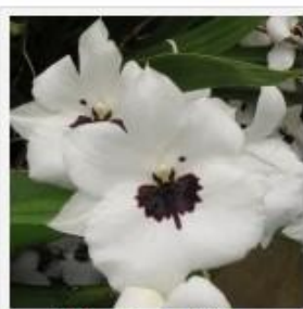
Milioniopsis Lillian Nakamoto 'Tanto'

Tanto prefers a coco/perlite potting mix that retains moisture between watering but is free draining, as the last thing you want to do is sit a Milioniopsis in water. Milioniopsis do very well where their roots are kept cool during the summer months and have plenty of humidity around them, so the pot in pot technique is recommended. Pot in pot is where you place a terracotta pot (larger than your specimen orchid pot) in a tray of water, and then fill the inside of the terracotta pot with gravel, on which is placed your specimen orchid pot above the water level. The water will evaporate up through the terracotta pot and keep the roots cooler and surrounded by very high humidity, something that Milioniopsis love. They also don't like to be out in the rain, so are best in a covered greenhouse or growing so that the foliage stays dry.