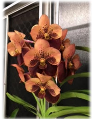
V. Gulf of Diam X V. sanderana