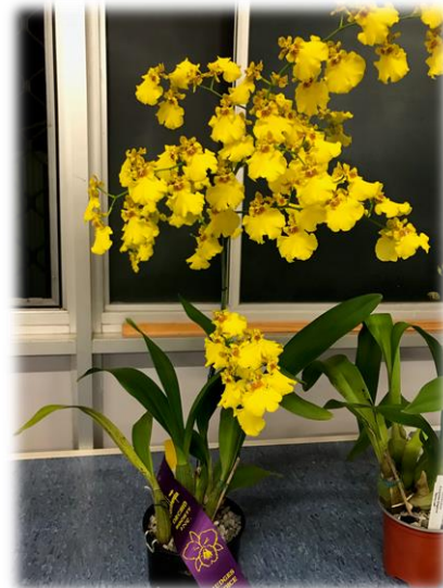
Oncsa. Sweet Sugar