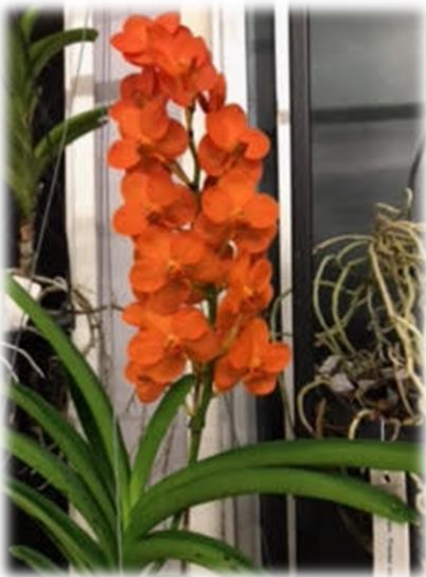
V. Brightons Gold 'Korat'