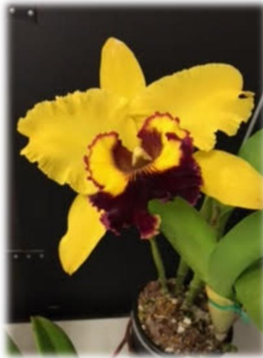
Rlc. Willette Wong 'The Best'