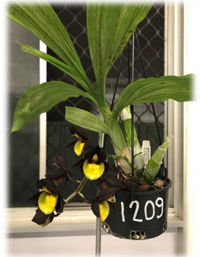
Ctsm. Vaseito's Moonlight