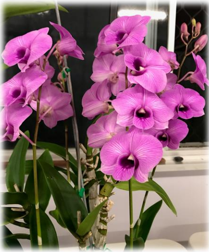
Den. (Burana Candy X Chao Praya Gem)