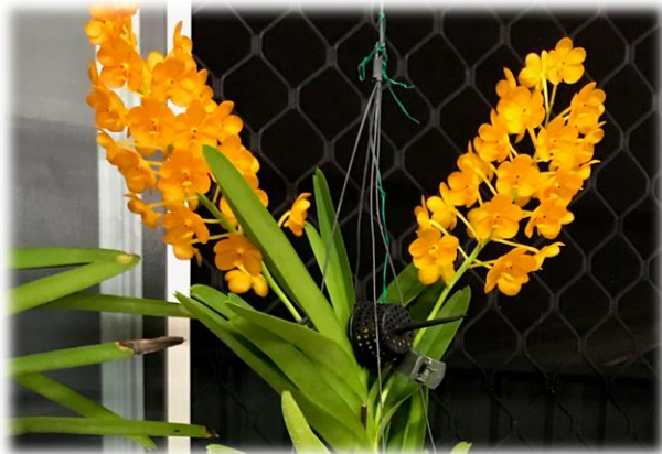
Ascda Nam Phung X Asdm miniatum