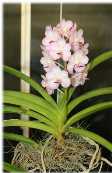
Van. Viboon Velvet 'Korat'