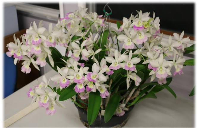
Bc. Hawaii Stars 'Only One'