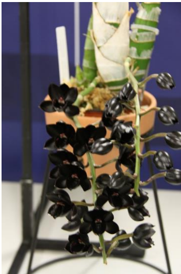
Fdk. After Dark 'SVO Black Pearl'