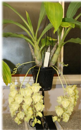
Clo. White Magic 'Ellie'