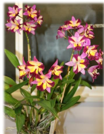
Gct. Sogo Doll 'Little Angel'