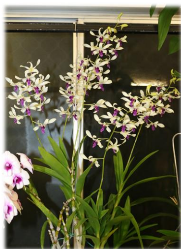
Den. Genting Lipstick

The closing date for articles to be included in the next newsletter are to be received by the 6 th July 2021; articles received after that date will be included in the following month.