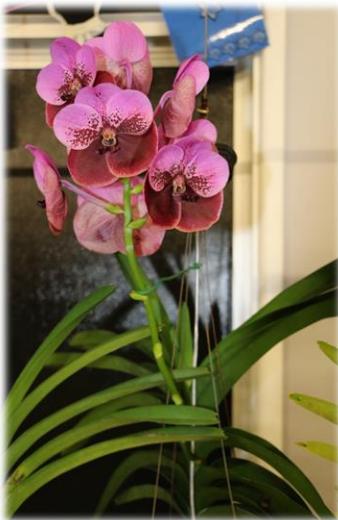
V. Pakchong New Land