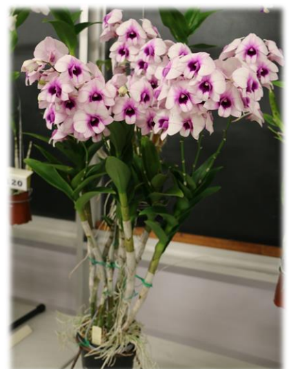
Den. Her Majesty (not registered)