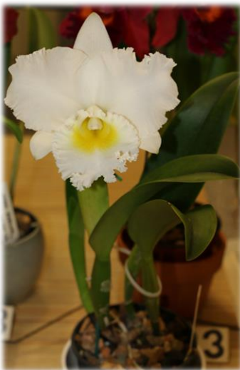
Rlc. Burdekin Dream 'D.J.'

Contact Jeff Bloxsom – 0407995122 if you wish to come