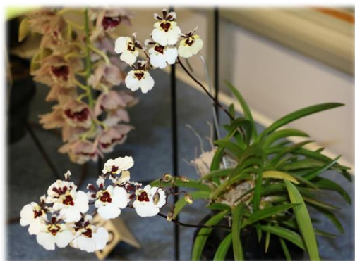
Tolu. Petite White (not registered)