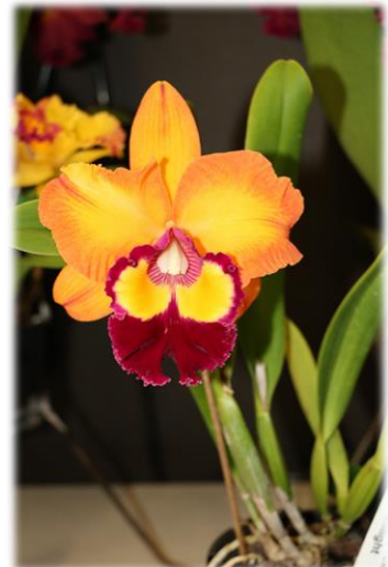
Rlc. Bangkok Sunlight