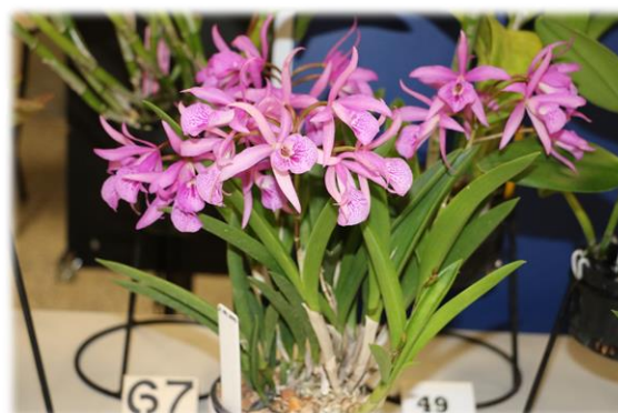
Bc. Maikai 'Mayumi'