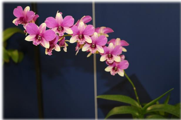
Den. Triple Fantasy

Next Monthly Meeting: Tuesday 22 nd June 2021. Starts 7:30pm.