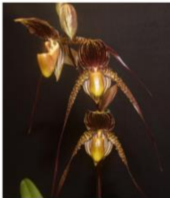
Paph. Johana Burkhardt 'Janet's Gem' FCC/AOC