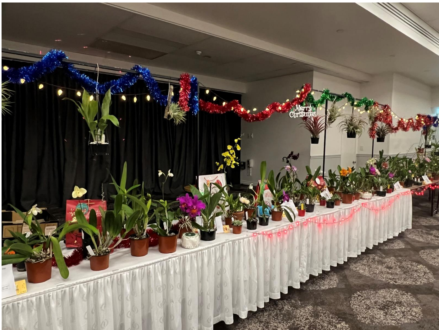
Table of our multi-draw raffle at Christmas Awards Dinner