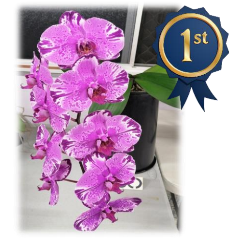
Jenkins / Kuhl