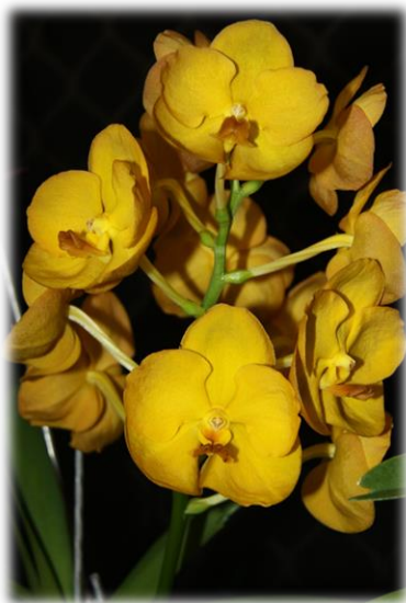
V. Yoshiko Ise