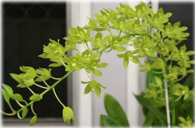
Gram. scriptum f. citrinum