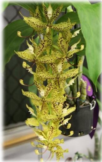
Cyc. Jumbo Cooper X Cyc. pentadactylon