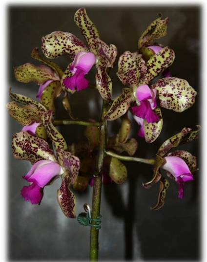
C. Deception Leopard