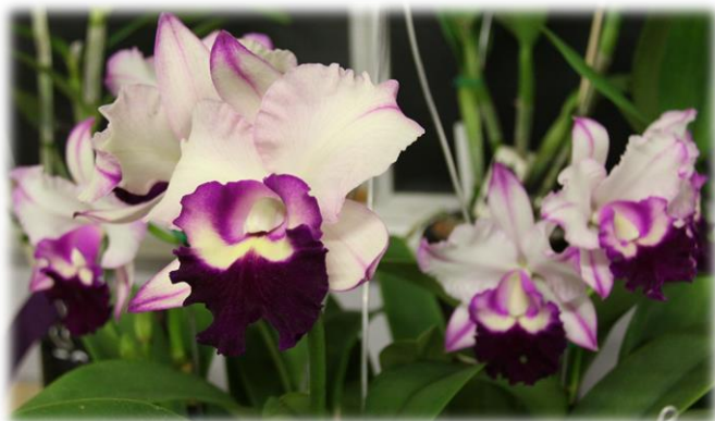
Rlc. Chief Journey 'First Class'