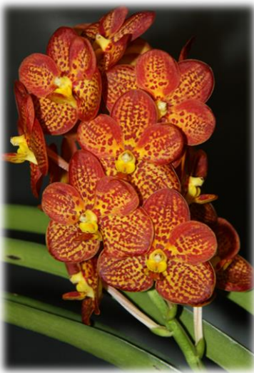
V. Crownfox Golden Dawn