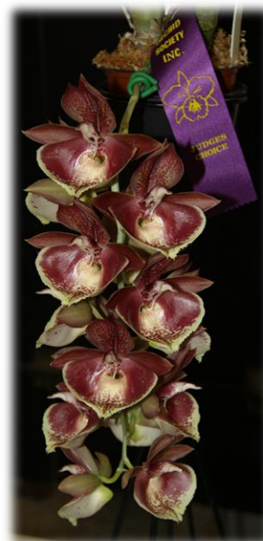
Ctsm pileatum X Ctsm. Jumbo Heart