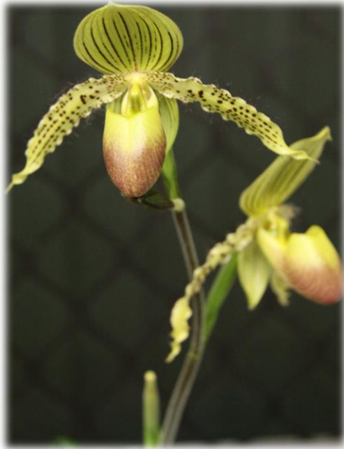
Paph. Prime Child