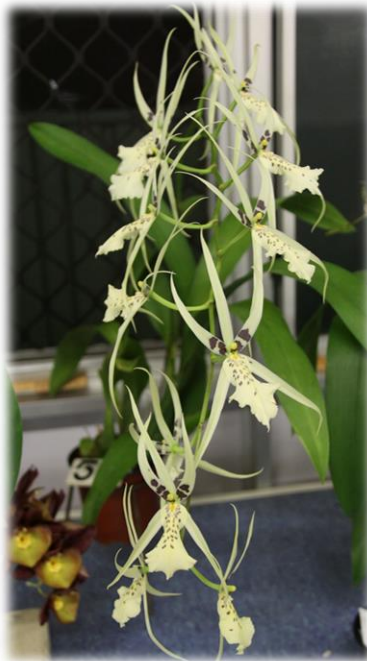
Brs. Rex X Brat. Goodale's Gift