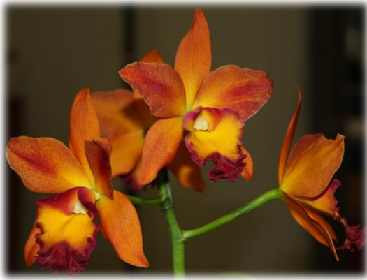
Thw. Chief Sweet Orange 'Sweet Orange'