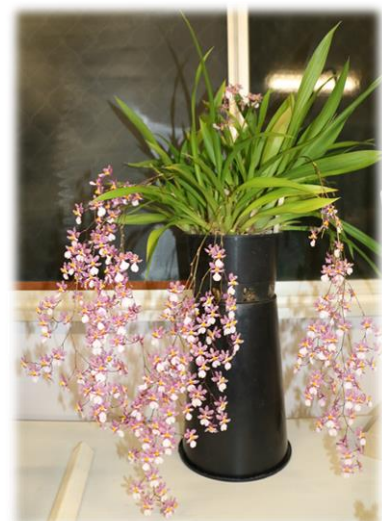
Onc. (ornithorhynchum x onustum) X ornithorhynchum