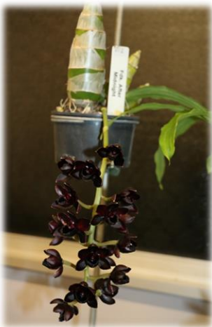
Fdk. After Midnight