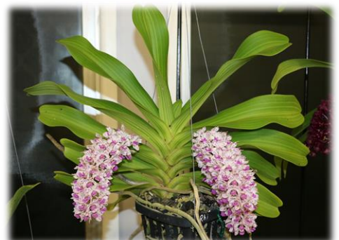
Rhy. Gigantea (Advanced)