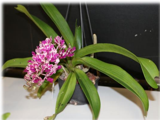
Rhy. Gigantea (Novice)