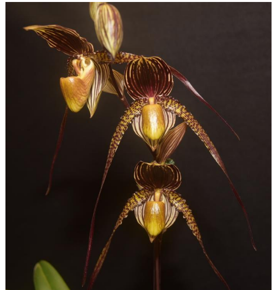
Paph. Johanna Burkhardt 'Janet's Gem' FCC / AOC. (pending)