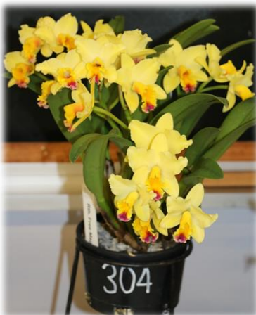
Rth. Free Magic