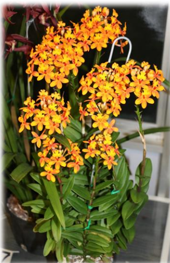
Epi. Comet Valley 'Flash'