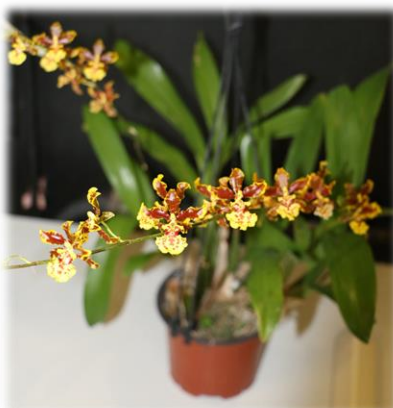
Onc. Space Race