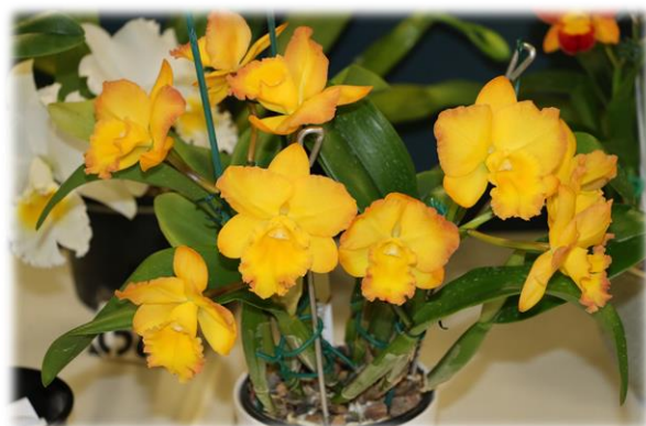
Rth. Redland Nugget 'Mint'