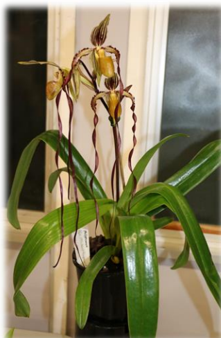
Paph. Michael Koopowitz