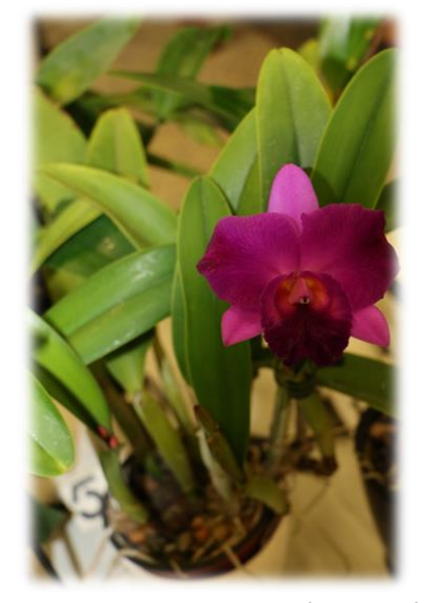
Rlc. Glenlee Magician 'Glenlee'