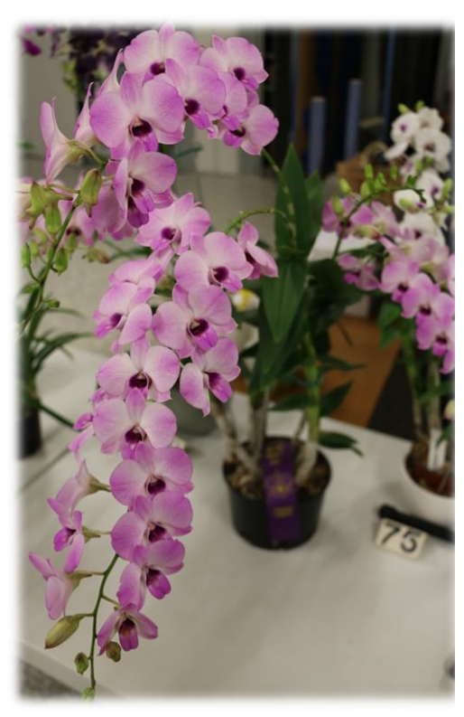
Den. (Burbank Sweet X Lady Gem)