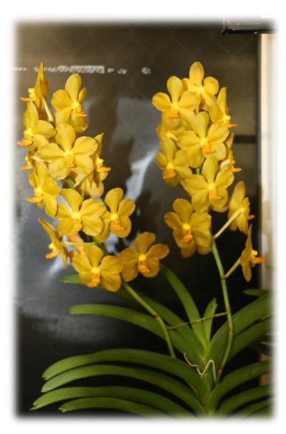
V. Super Cooper