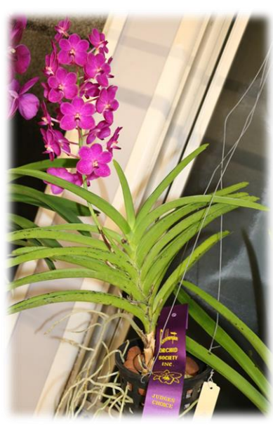
V. Camano Beauty 'Pink'