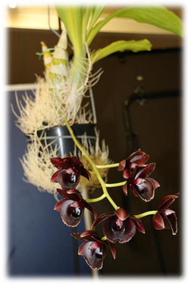
Fdk After Dark X Ctsa. Orchidglade Davie Ranches