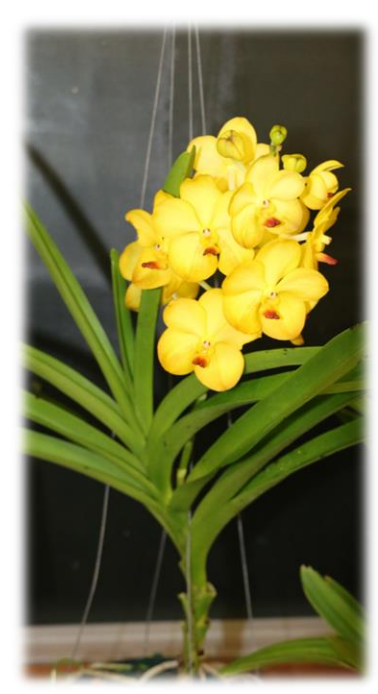
V. Fuchs Sunset X Chtra. Keereeboon