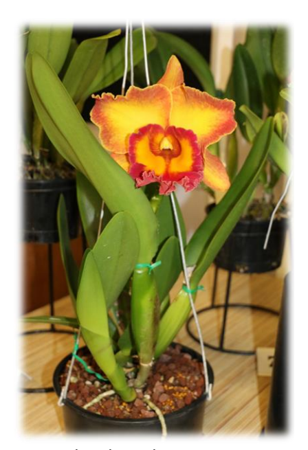
Rlc. Chomthong Fancy "Classy Companion"