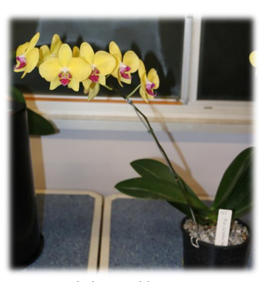
Phal. Ox Golden Star