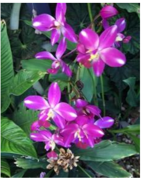
Spa. Hybrid (Cabaret)