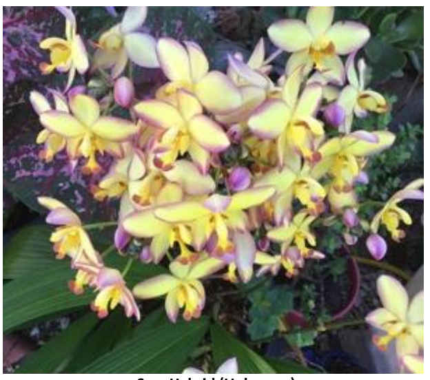
Spa. Hybrid (Unknown)

retention. This can be obtained by adding cocoa peat, or black peat and or perlite to a traditional small bark and fine charcoal substrate. It has small black pseudobulbs that will grow to be semi-submerged in the potting mix or ground and are quiet crowed in mature specimens. The thin pleated, board leaves which can be up to four per bulb, emerge from the top of the pseudobulbs. The flowers stalks emanate from the side basal shoots and can be up to 75 cm long. Flowers are variable and range from bright purple to mauve or white. The species and their hybrids flower spasmodically throughout the year but are more profuse in Autumn and Winter in Central Queensland. Slow-release fertilizer is a good regime to adopt for feeding as they require regular feeding to produce their best. As