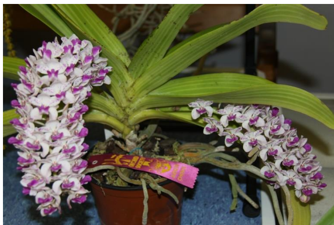
Rhy. gigantea – B & N Lakey