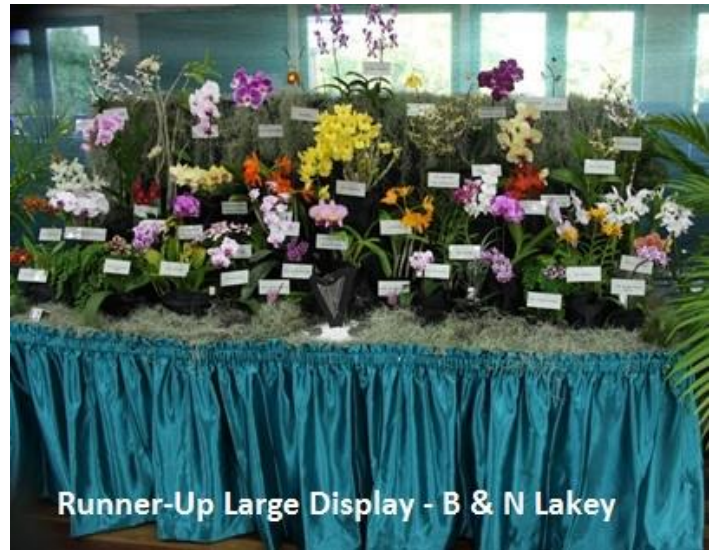
Runner-Up Large Display - B & N Lakey