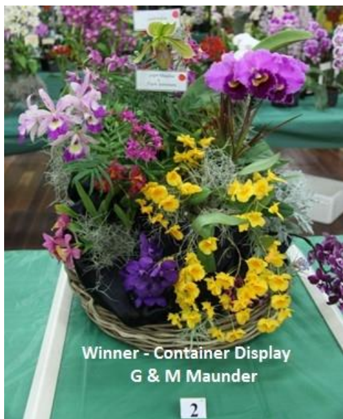
Winner - Container Display G & M Maunder