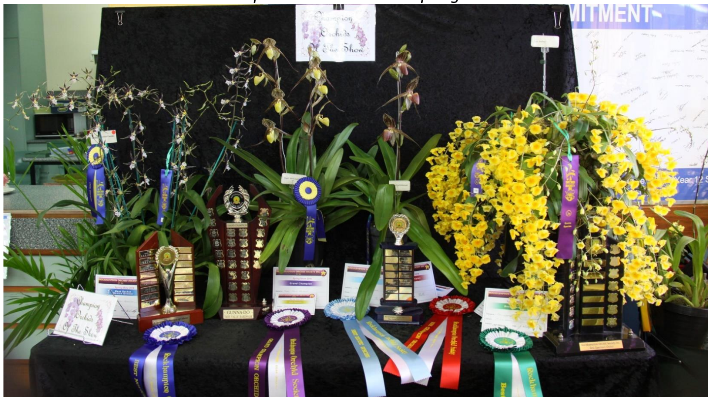
Champion Orchids table at Spring Show

Till next time my prayers are with you. Ellie