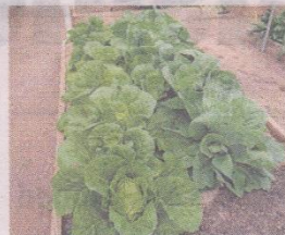
He grows just about everything.

competition is nice as well," the green thumb explained.