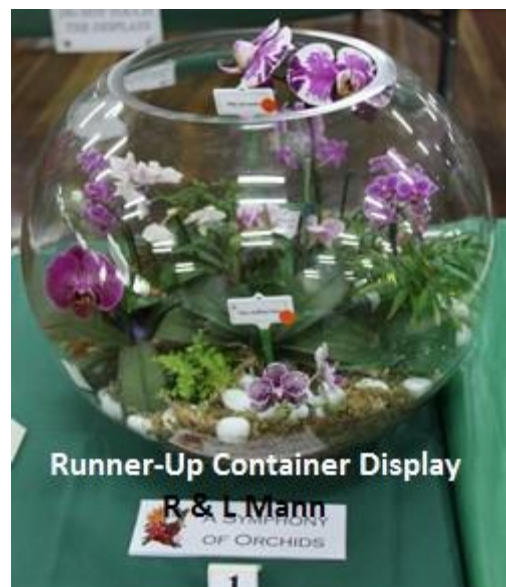
Runner-Up Container Display