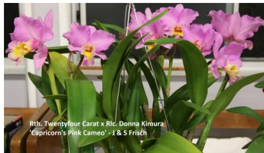
Rth. Twentyfour Carat x Rlc. Donna Kimura 'Capricorn's Pink Cameo'