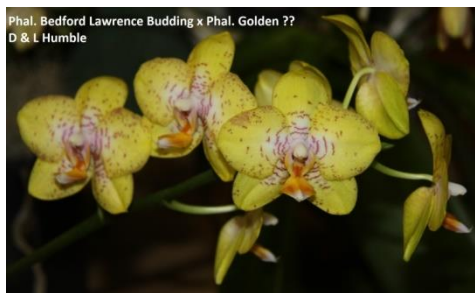
Phal. Bedford Lawrence Budding x Phal. Golden ?? D & L Humble