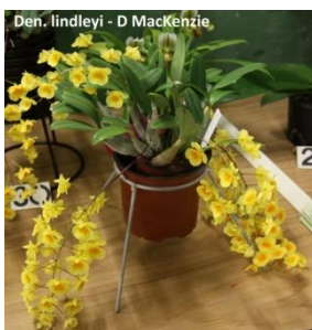
Den. lindleyi