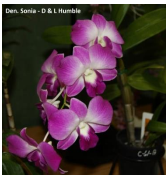
Den. Sonia - D & L Humble