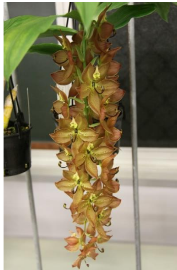
Cyc. Arita