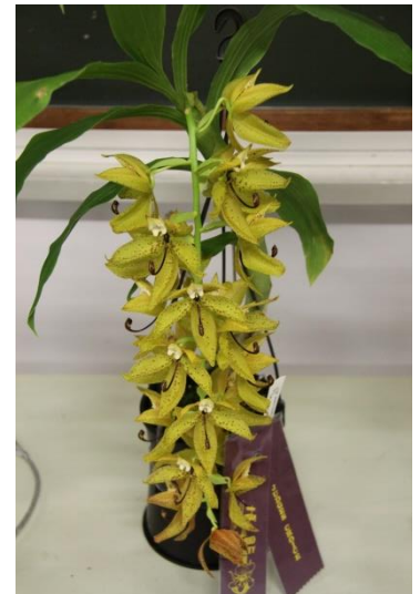
Cyc. Arita