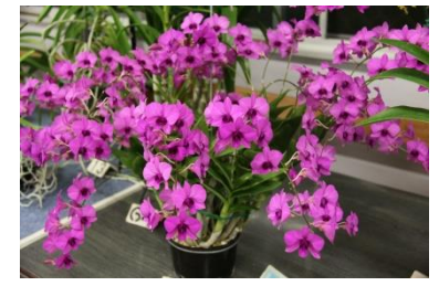
Advanced popular vote winner - Feb Meeting