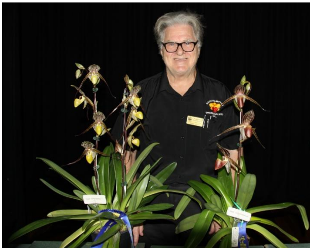
< 2016 Spring Show