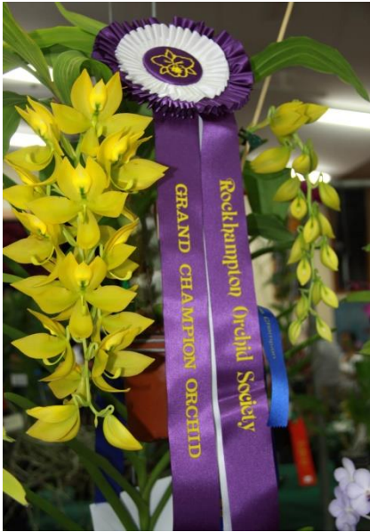
< 2015 Autumn Show