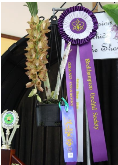
< 2018 Autumn Show