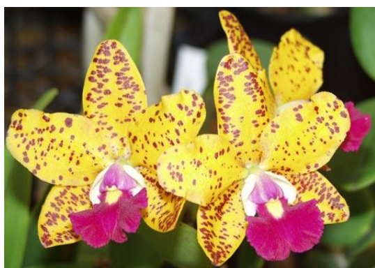
C. Jungle Gem

Yet, while this cultivar has been the exception size-wise, in the main the outcome has been a new range of 'leggy-spotty Catts'. Hence, the need has arisen for inclusion of a class in show schedules by most societies to cover this type of Cattleya breeding as the old collective of 'Bifoliate' is definitely now too broad of a classification.