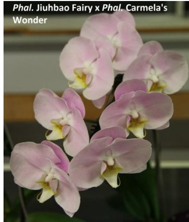
Phal. Jiuobao Fairy x Phal. Carmela's Wonder