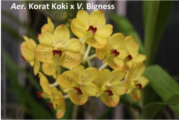
Aer. Korat Koki x V. Bigness