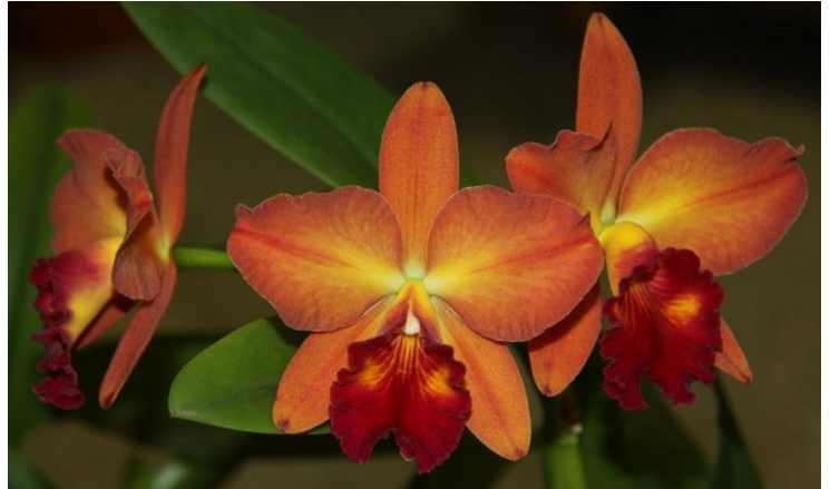
Rlc. Little Toshie 'Golden Dream'