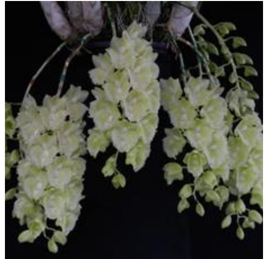
Clow. White Magic 'Ellie' >

And now, with advancing years, we are happy to be easing back a bit and seeing a new generation of orchid enthusiasts continue with the support and promotion of the society we have enjoyed for so long. When we look back on our 50 plus years as members of R.O.S. we are grateful for the many life-long friendships we treasure, the adventure of so many trips away and the excitement of being part of nearly every show during that period.