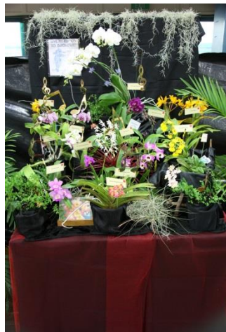
Small Display No. 2