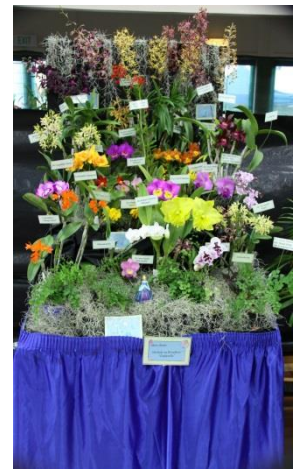
Small Display No. 4