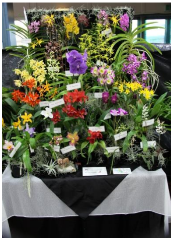
Small Display No. 1