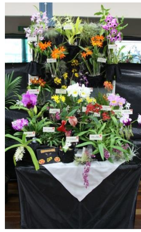
Small Display No. 3