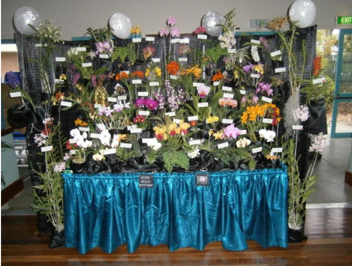
Best Large Display