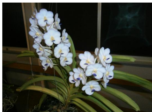
Vasco. Crownfox Magic