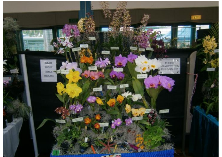
Best Small Display