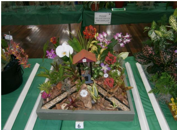
Best container garden