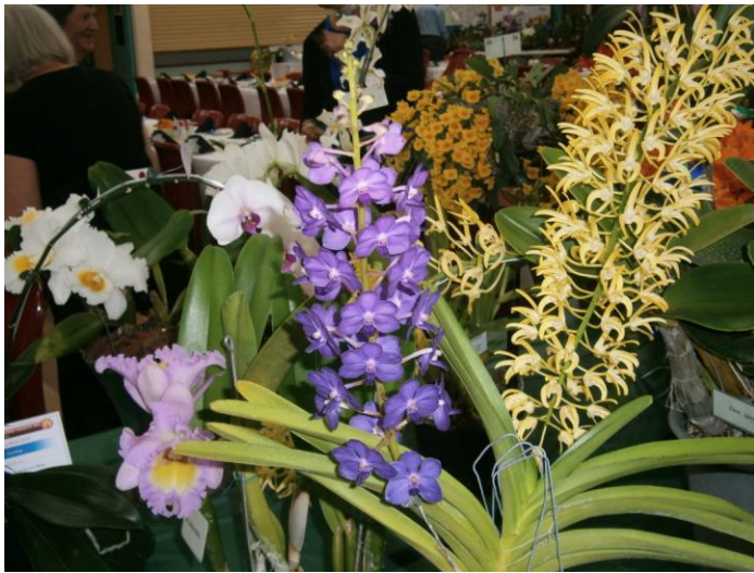
Grand Champion Vasco. Pine Rivers