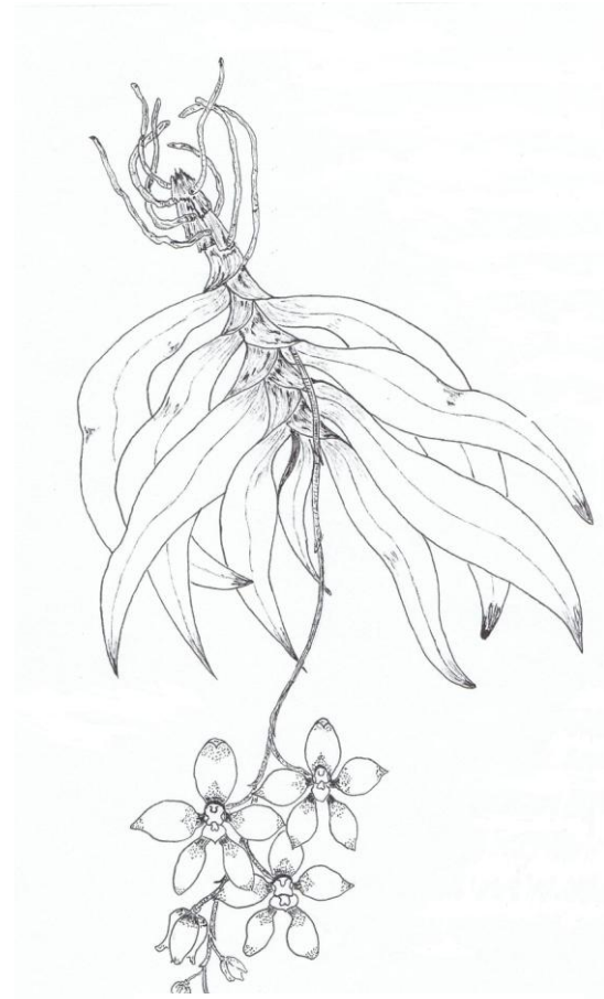
Sorchochilus fitzgeraldii By Hymn

Rockhampton Orchid Society Inc. www.rockhamptonorchidsociety.com.au