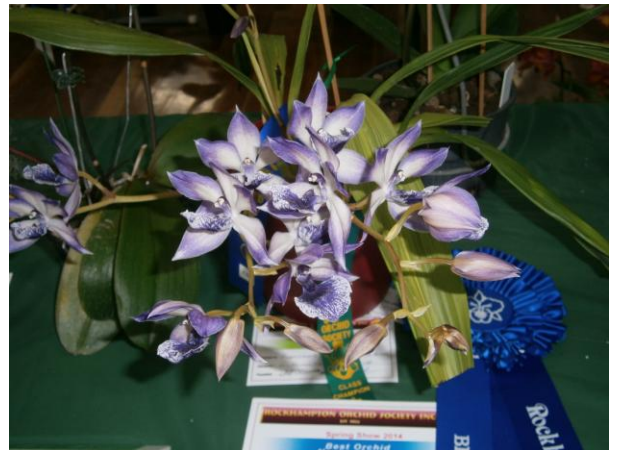
Best novice orchid