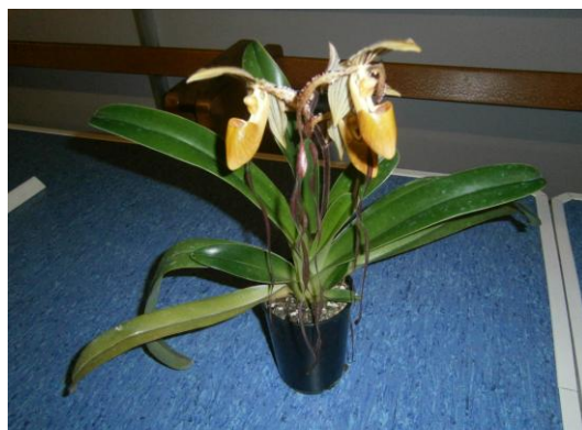
Paph. Michael Koopowitz