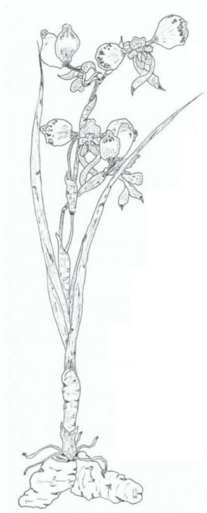
Diuris maculate by Hymn

Rockhampton Orchid Society Inc. www.rockhamptonorchidsociety.com.au