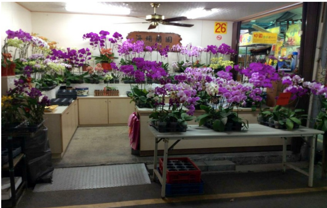
A sales booth at the Tainan City market. Pick of the stall for $10 AD.

Likewise, the number of large flowering cattleyas for sale was very impressive. Many of the stands also included associated orchid growing paraphernalia such as pots, fertilizers, mounting blocks and stakes and it was interesting to see the different styles and techniques used. Of special interest was the demonstration of how to stake Phalaenopsis.