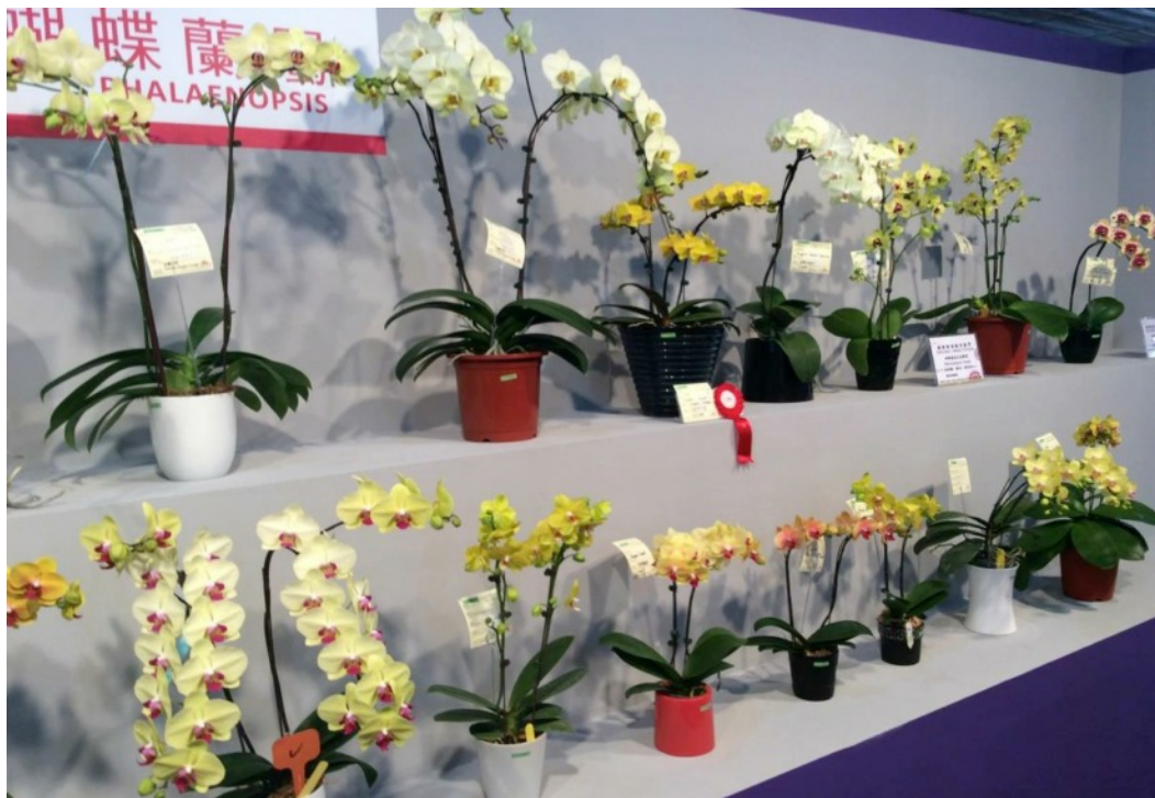
Miniature and novelty Phalaenopsis on the judging bench.

The orchid display section is staged over two halls and the surrounding grounds and minor pavilions which house cafés and food stalls and is also where market type traders display their wares. The first hall houses the massed displays and accentuates the theme of each show, while the second is the judging hall. This year the theme was 'The Moment'. Amongst sweeping vistas of thousands of Phalaenopsis and supporting orchids such as Paphiopedilums, Cattleyas and Dendrobiums, waterfalls cascaded and mood lighting certainly captured 'the moment' for orchid and nature lovers alike. Everywhere amongst this overwhelming riot of colour attendees could be seen taking group photos and partaking in the almost obligatory current craze of talking 'selfies'.