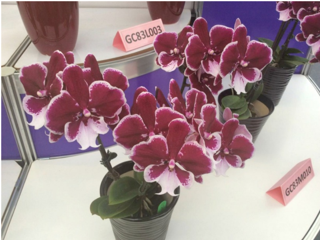
The future of Phalaenopsis, the next generation of breeding on display at TIOS 2015

It can be seen that innovation and sponsored commerce has over the last decades certainly placed Taiwan at the forefront of the world's orchids industry. This continued innovation was on display at the TIOS with the development of a new shape Phalaenopsis. It has a wide lip and is along the lines of the pansy-type hard-cane dendrobium of a decade or so ago. While not available to the collecting public yet, the developers told me it would be introduced worldwide in a couple of years. I am sure it will renew interest in Phalaenopsis and create a temporary headache for the judges once they appear at shows. So this is a heads up for what is on the way and an exclusive for Orchids Australia readers!