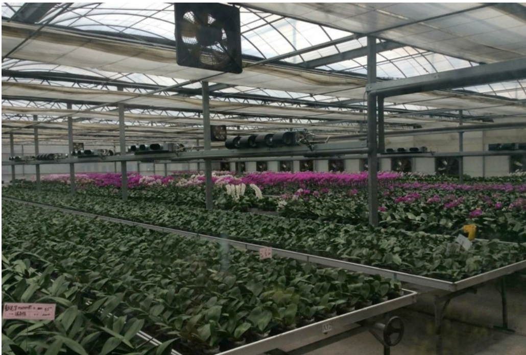
A high-tech commercial greenhouse full of Phalaenopsis seedlings