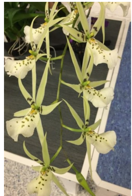
Brs. Rex X Brat. Goodale's Gift