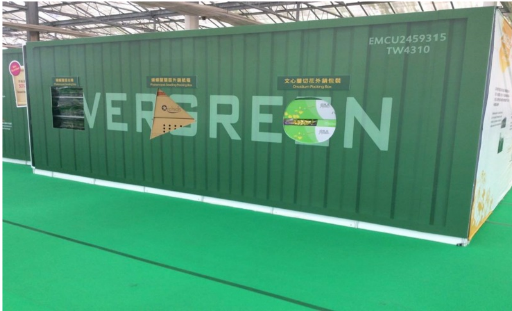
A shipping container purpose built to convey Phalaenopsis to Europe and the USA

Here all manner of equipment from secateurs to shipping containers are displayed and orchid nursery owners and managers conduct the commercial aspect of the show. Recent shows have resulted in upwards of 10 millions US dollars in commercial contracts being clinched and it was expected this would be the case with this show as well.