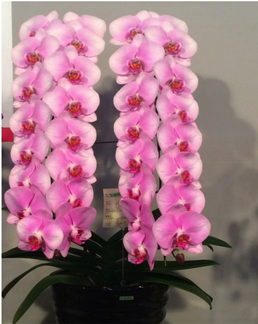
An example of the quality of the Phalaenopsis presented for judging.