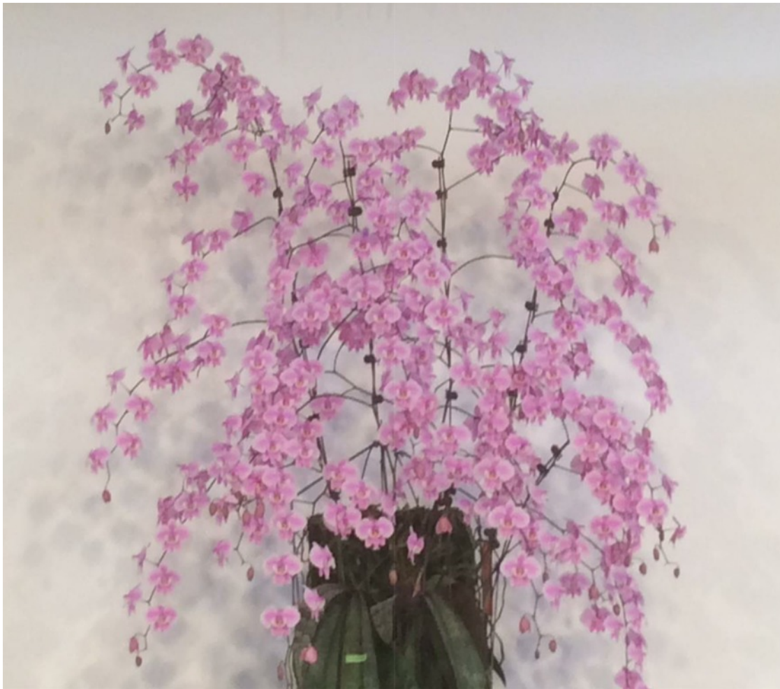
This huge specimen of Phal. schilleriana won Grand Champion Orchid

It is a massive site divided into grids where purpose built high –tech greenhouses, storage facilities and laboratories are built over many hectares all with connecting streets. These are in the main full of Phalaenopsis, which is the staple orchid on which Taiwan’s orchid exports are founded. We visited OX Orchids at one of these facilities and could see workers in the huge greenhouses caring for the Phalaenopsis seedlings and others packing flowering orchids for shipping.