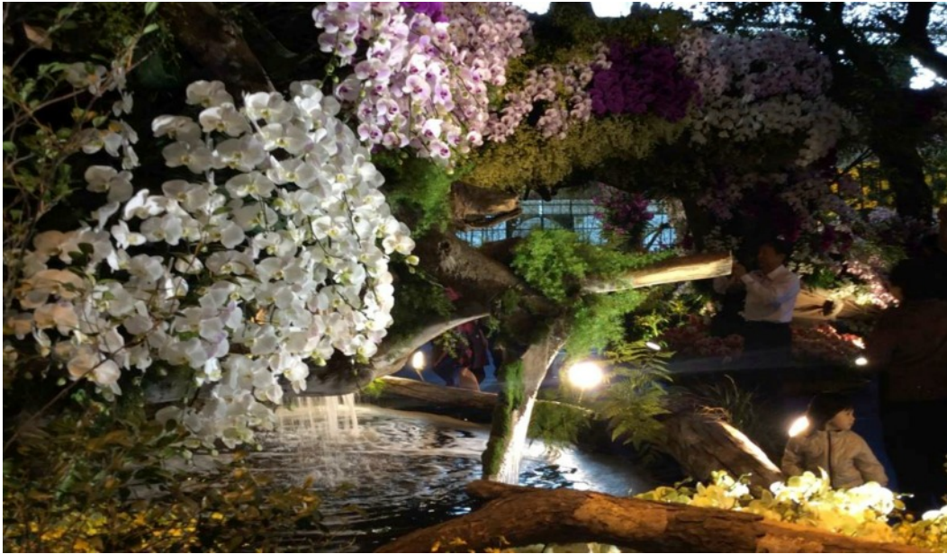
A waterfall complements the displays in the main pavilion.

Amongst the displays was one featuring the native orchids of Taiwan. It was quite surprising to see just how many orchids are endemic to this island country but when one considers its geography it is understandable as the eastern half is very mountainous and humid. Phalaenopsis, Paphiopedilum, Cymbidium, Bulbophyllum and Dendrobium are the main genera represented. Perhaps the most widely recognized is the Negro-Histule group of dendrobium, also known as the Formosan type dendrobium group. 'Formosa' of course, being the previous colonial name by which Taiwan was once known. Many of these have been hybridized and perhaps the most notable is Den Dawn Maree a primary hybrid between Den. formosum and Den crenatum.