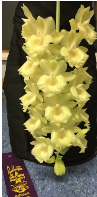
Clo. White Magic 'Ellie'