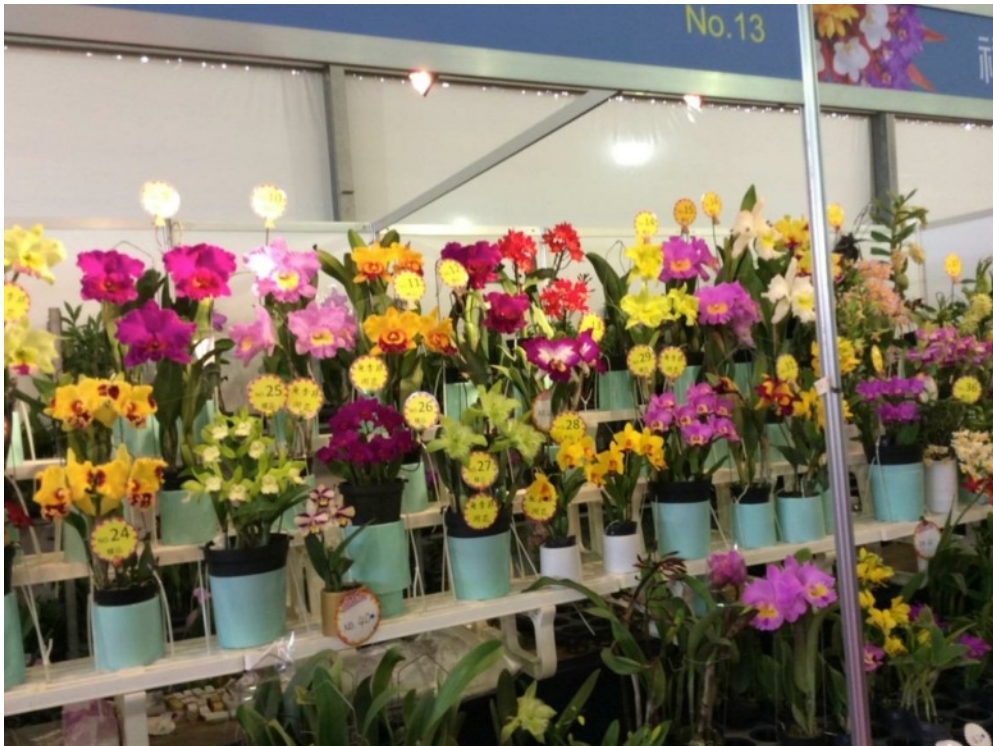
A typical sales booth at the TIOS

Amongst the displays was one featuring the native orchids of Taiwan. It was quite surprising to see just how many orchids are endemic to this island country but when one considers its geography it is understandable as the eastern half is very mountainous and humid. Phalaenopsis, Paphiopedilum, Cymbidium, Bulbophyllum and Dendrobium are the main genera represented. Perhaps the most widely recognized is the Negro-Histule group of dendrobium, also known as the Formosan type dendrobium group. 'Formosa' of course, being the previous colonial name by which Taiwan was once known. Many of these have been hybridized and perhaps the most notable is Den Dawn Maree a primary hybrid between Den. formosum and Den crenatum.