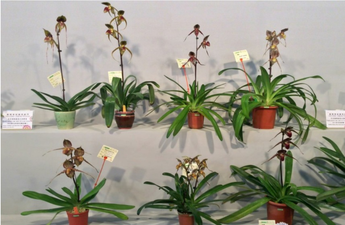
Multifloral Paphs were well represented in judging and on the sales booth

These included Multiflorals and Parvisepalum (Chinese type) both with species and primary hybrids relatively freely available and very keenly priced. Most were on average half price or less of what you would pay in Australia and that's if they could even be obtained.