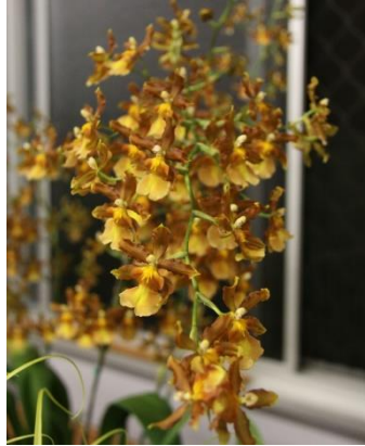
Ons. (Colm.) Catatante "Kilauea Karma"