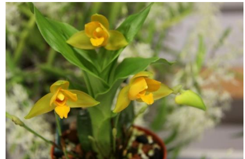
Lyc. Fairy Gold