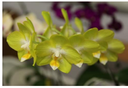
Several of the plants tabled at the November Meeting