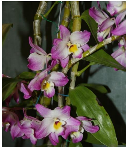
This is my orchid Den. Joyful Heart and you can notice a couple of keikis amongst the flowers.

Our upcoming show has the theme "Orchids on Broadway" and there are many Broadway Shows to choose from to bring the theme into our displays, so thinking caps on everyone. Let's make this the best show ever.(4)