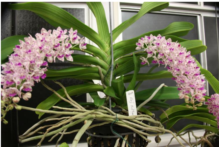
Rhy. Kultana