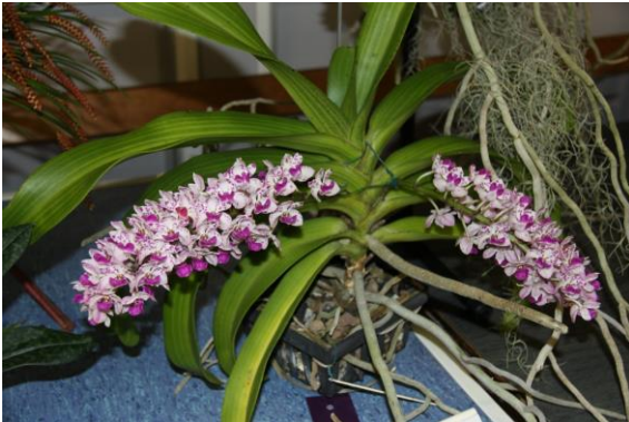
Rhy. gigantea