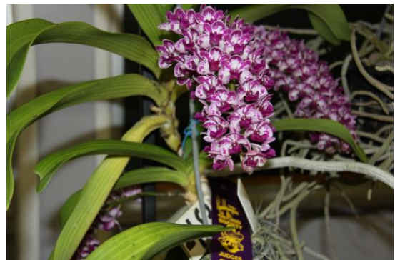
Rhy. gigantea