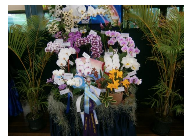
Best Small Display The Handleys