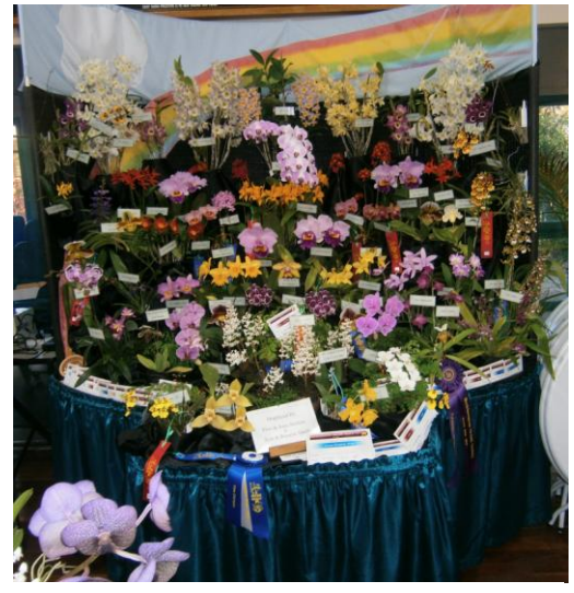
Best Large Display Smith & Shelton