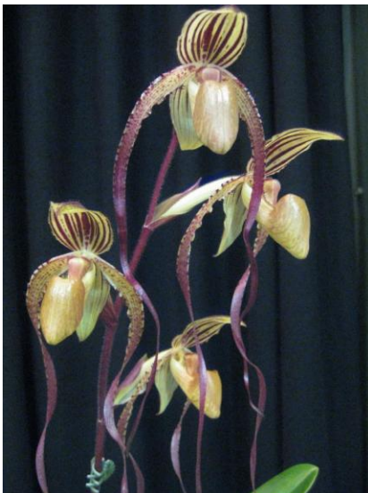
Paph Angel Hair