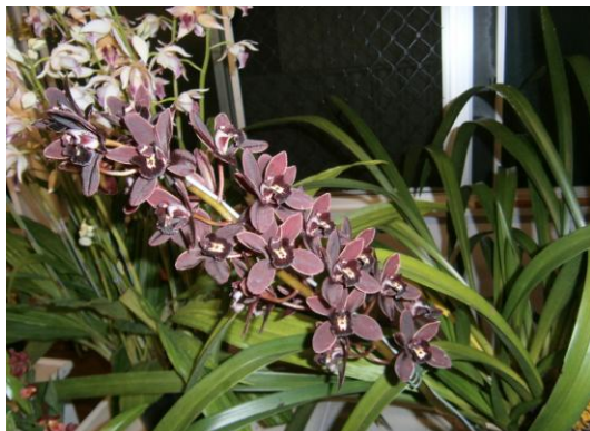
Cym. Radiant Ruby