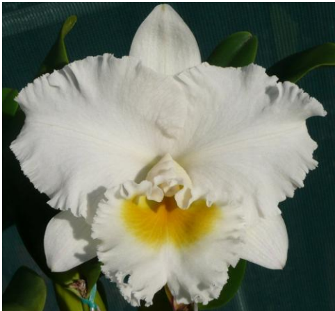
Blc Dal's Passion