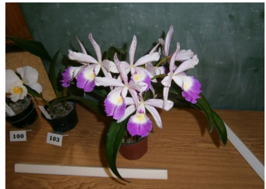
Blc. Glorious May