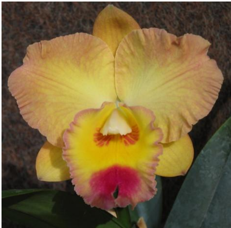
Rsc Rosella Scorpio