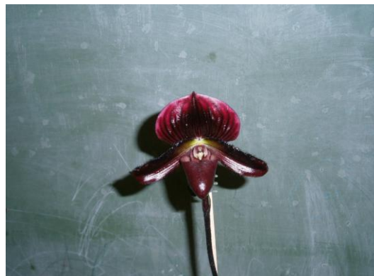
Paph. Hung Sheng Web