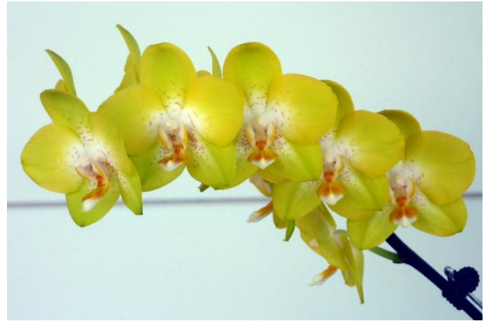
Phal. I-Hsin Sunflower