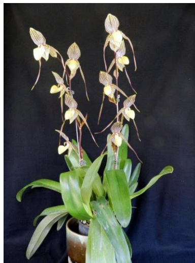
Paph. Saint Swithin