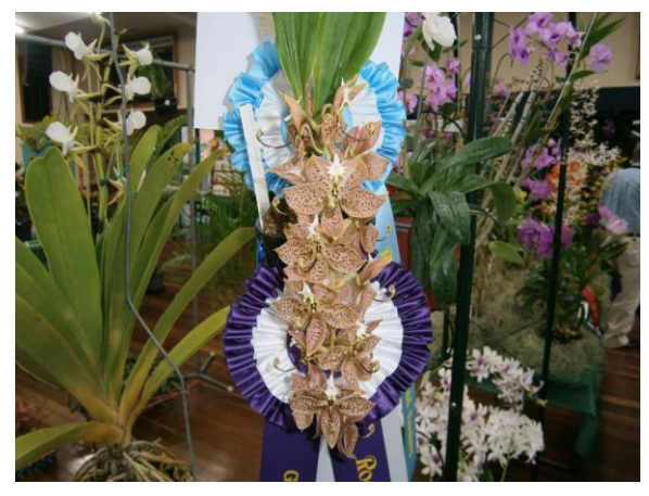
GRAND CHAMPION & Best Species

A complete list of all the show results is published elsewhere in the newsletter.