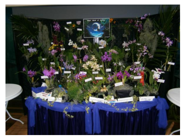
Mann, Lucke & Dahler Large Display