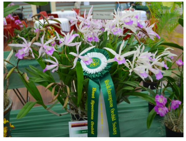
Best Specimen B & N Lakey