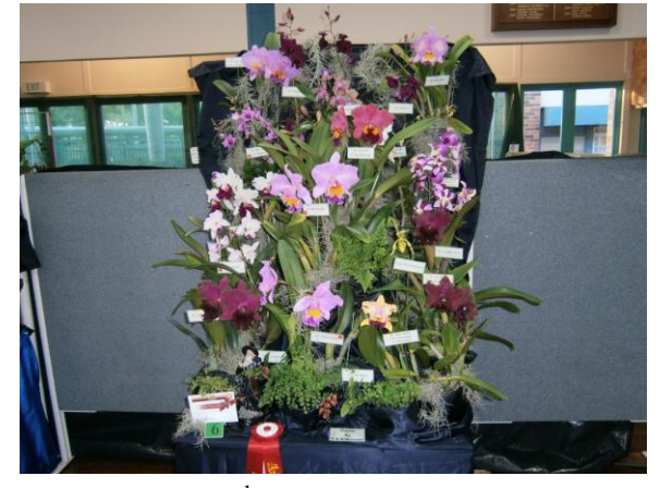
2<sup>nd</sup> Small Display G & M Maunder