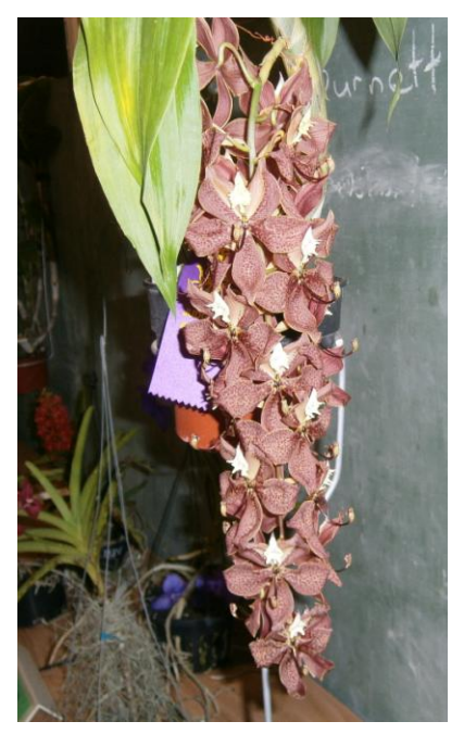
Cycd. Jumbo Puff