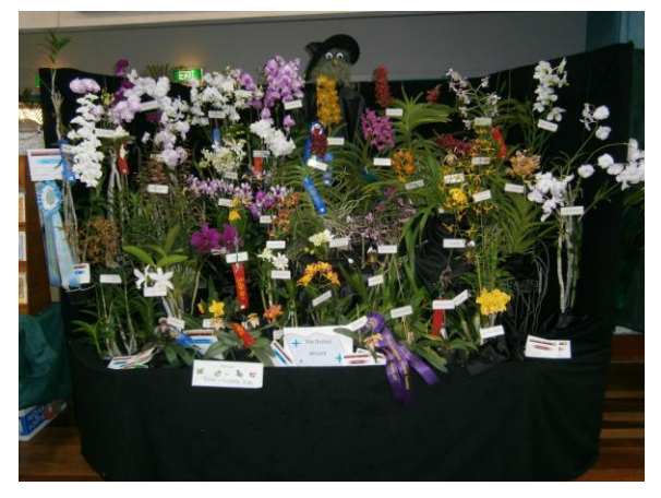
1<sup>st</sup> Large Display T & E Dean