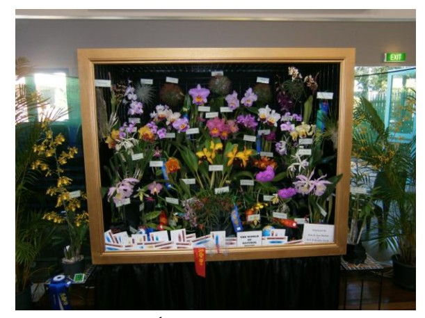
2<sup>nd</sup> Large Display Smith & Shelton