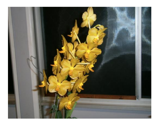
Ascda. Super Cooper