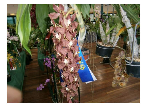
R/Up Grand Champion