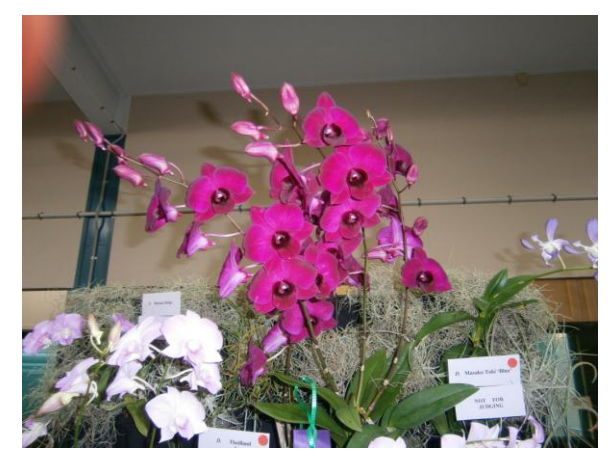
Best Novice T & N Craig