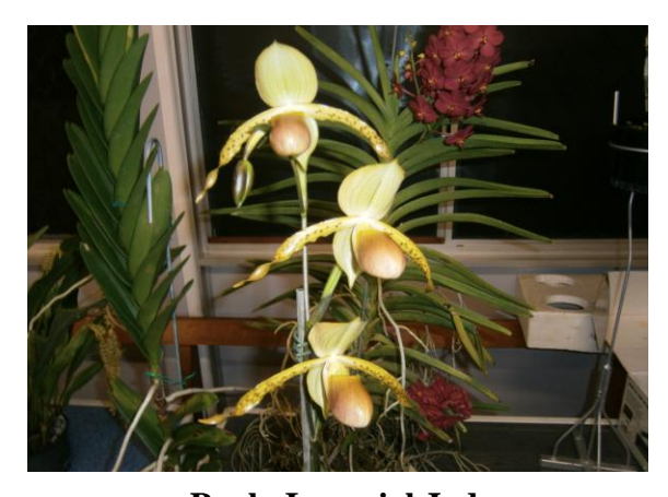
Paph. Imperial Jade