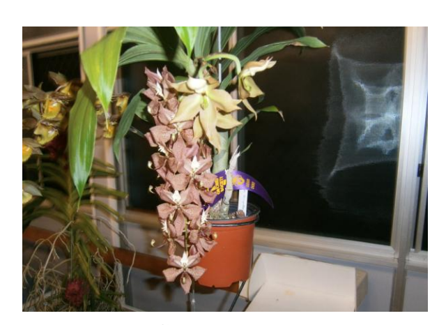
Cyc. Tawny Bar