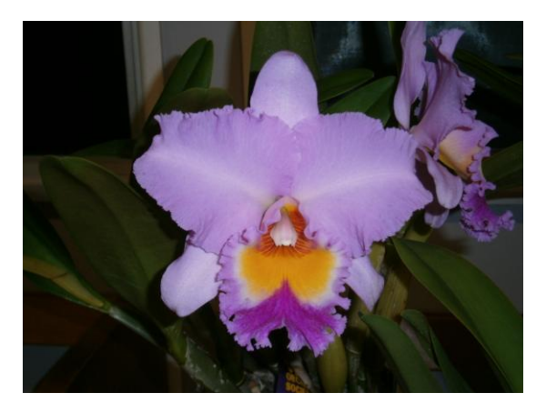
Rlc. Donna Kimura

Photo of Phrag. Calurum not taken due to fall of flower.