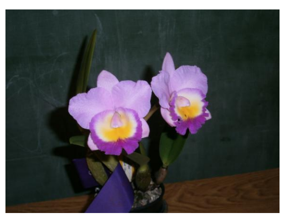
Rlc . Lakehaven Pearl