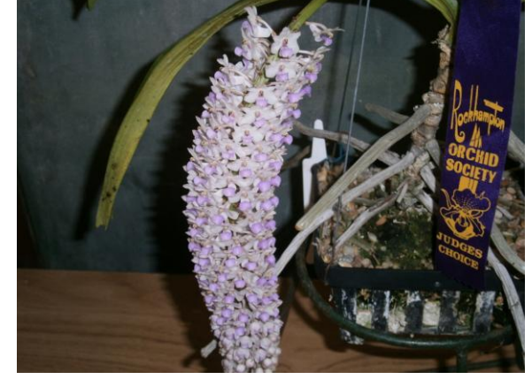
Rhy. retusa Shown twice once showing both floret's & then a closer view of one floret