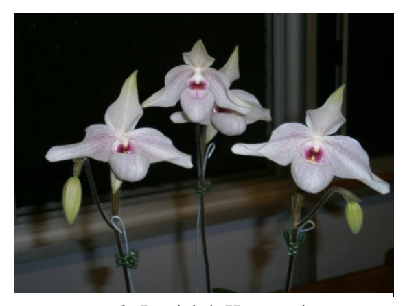
Paph. Lynleigh Koopowitz

CattleyaBlc. Mount Isa x Rlc. Glenn MaidmentR&L MannVandaceousAscda. Khun Nok x Rhy. coelestisR&G WakefieldDendrobiumDen. ("Rai King Blue Inky Blue") ?? (*)R&L MannMiscellaneousOnc. ("Baipai 'Pink Skirt'") ?? (*)G&M Maunder(*) These names not registered