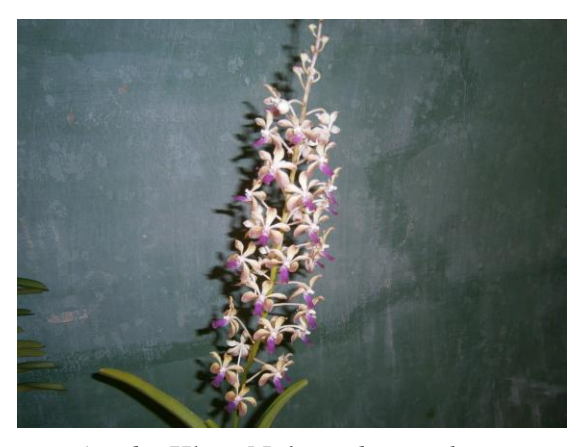
Ascda. Khun Nok x Rhy. coelestis