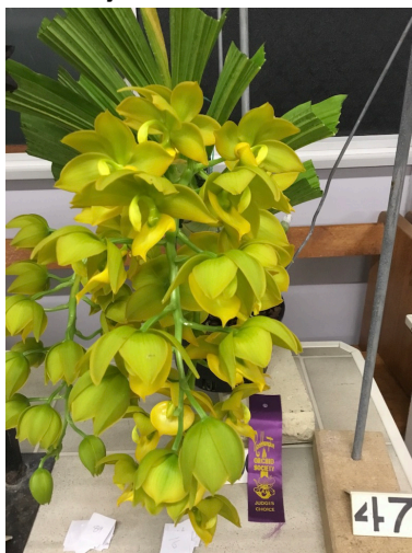
Cycd. Jumbo Puff