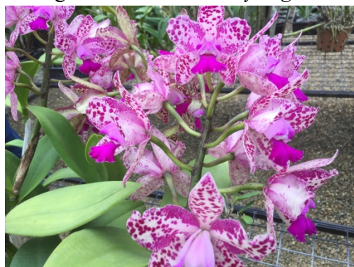
C. Deception Cacique

In recent years breeding programs from nurseries such as Queensland's own Aranbeem Orchids have produced some beautiful hybrids from bi-foliolate species including, those belonging to the 'Deception' line of cultivars which we are presently seeing in flower. C. amethystoglossa is a free flowering orchid which can have two flowering