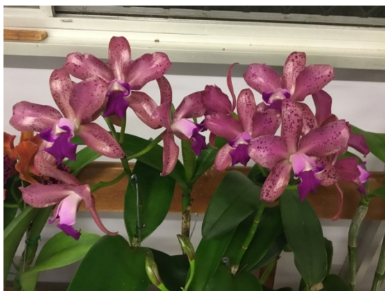
Ctt. Deception Drop

** = ( V. tessellata x V. insignis ) x Vdpa. Mini Palmer)