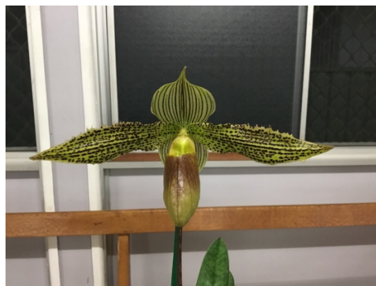
Paph. Neeri Glow'Grub'