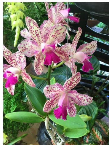
C. amethystoglossa 'Jaguar' AD-AM/AOC.

The species of the month is Cattleya amethystoglossa . This Cattleya is endemic to Brazil and is widespread growing in lowlands to mountain foothills where its main hosts are trees. It comes from a group colloquially known as 'bi-foliolate cattleyas', i.e. having two leaves; which includes other species such as C. intermedia and C. aelandiae . In comparison to other orchids it has a large number of recognized forms and varieties. Orchidwiz lists 10 forms and 5 varieties. Likewise, it has been extensively used in breeding and has 140 first generation (primary hybrids listed). In addition, it has been widely 'line-bred' with some stunning cultivars produced such as, C. amethystoglossa 'Jaguar' AD-AM/AOC.