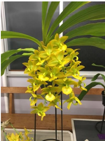
Cycd. Jumbo Puff