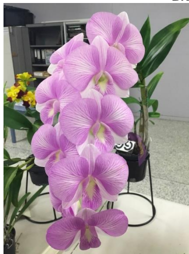
Den. Burana Stripe