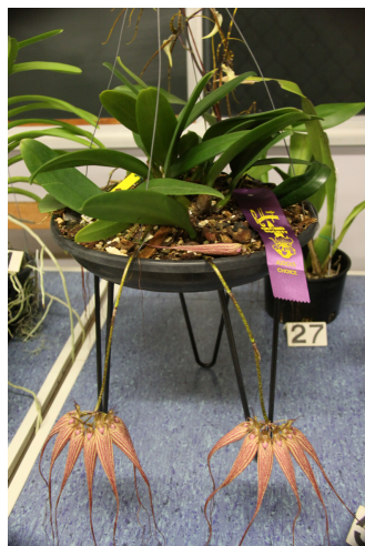
Bulb. Elizabeth Ann