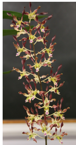
Den. Frazer's Blueray Twist