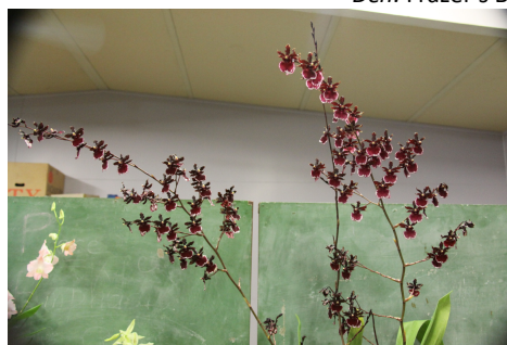
Ons. Succubus 'Night Shift'