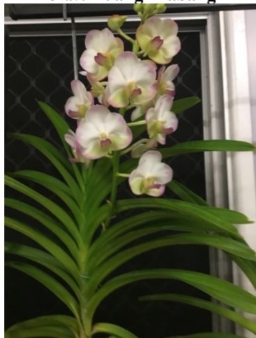
Aerdv. Luang Prabang