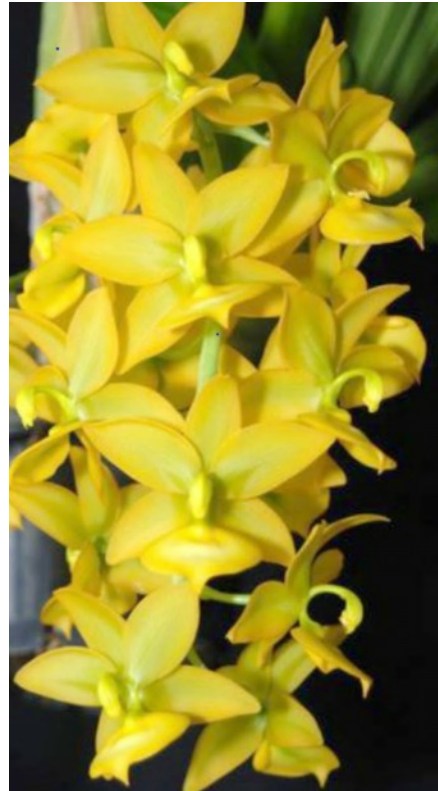
Cyd . Jumbo Puff 'Krisett' AM/AOS

This orchid's other endearing feature as opposed to Catasetum species and primary hybrids is its longer flowering period with flowers remaining viable for up to three weeks from opening. An outcome previously discussed that makes them more attractive to potential growers.