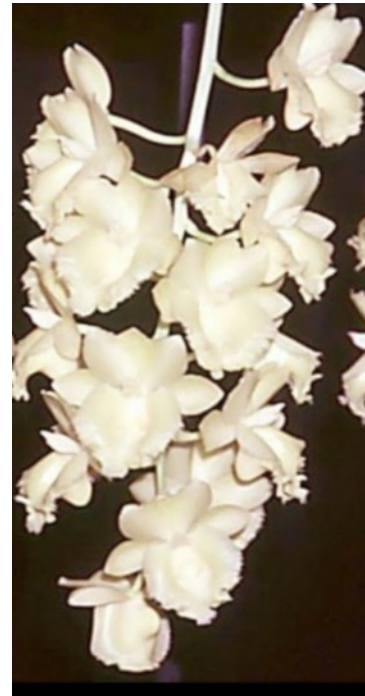
Clo. White Magic 'Krisett' HCC- AD/AOC

Thirteen years later, Jumbo Orchids bred and registered one of many of their Clowesetum hybrids, Clo. Jumbo Glory 'Jumbo Orchids', which is a cross of Cl. Rebecca Northern which contains two Clowesia species ( Cl. rosea x Cl. warscewiczii ) and Ctsm. Bound for Glory . This catasetum 's parentage shows yet again the use of the ubiquitous Catasetum pileatum which is a parent of Ctsm. Bound for Glory .