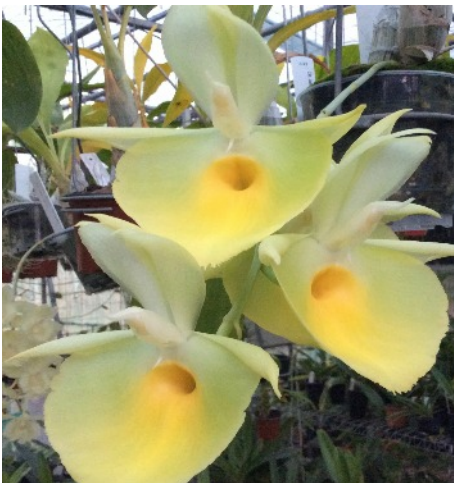
Ctsm. pileatum 'Oro Verde'

While not wishing to become too technical and before these new trends are addressed, it is probably timely to re associate just where Catasetinae fit within the Orchid Family. Catasetinae is a sub-tribe within the tribe Cymbidieae . Catasetum , Cycnoches , Clowesia and Mormodes are genera within Catasetinae . ( Taxonomy of Orchidaceae , Wikipedia, accessed 3-6-2015). Clowesia has been a subject of argument with taxonomists, with the species of this genera being classified by some, as belonging to the Catasetum genus. However, for this article they will be referred to as a separate genus. Put simply, Catasetinae are related to Cymbidiums and while Cymbidiums are found in the Eastern Hemisphere, mainly in Asia, Catasetums and their relatives are found in the Western Hemisphere in Central America and the northern section of the South American continent.