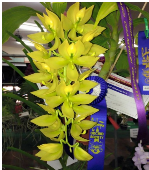
Cyc. Golden Showers 'Krisett' HCC/AOC

As predicted the pursuit of a blacker orchid flower than Monnier's creation continued over the next decade with the defining work by hybridiser and proprietor of Sunset Valley Orchids of California, Fred Clarke, coming to the fore. This culminated in the registration of the now famous 'black flower' Fredclarkeara After Dark, in 2002. (Orchidwiz, 11.3) Perhaps in a fitting tribute, the registrant has chosen his name as the tri-generic term to denote this orchid, which is allowable under the rules of orchid nomenclature and registration. (Handbook on Orchid Nomenclature and Registration Royal Horticultural Society, 1985)