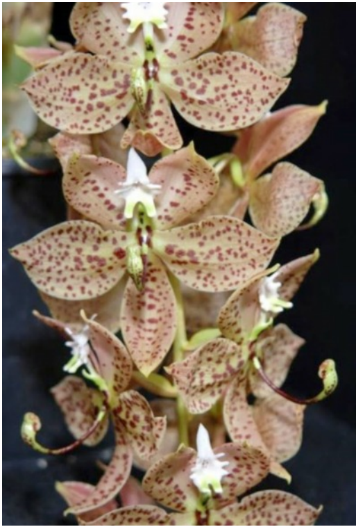
Cyc. bathiorum 'Krisett' HCC/AOS